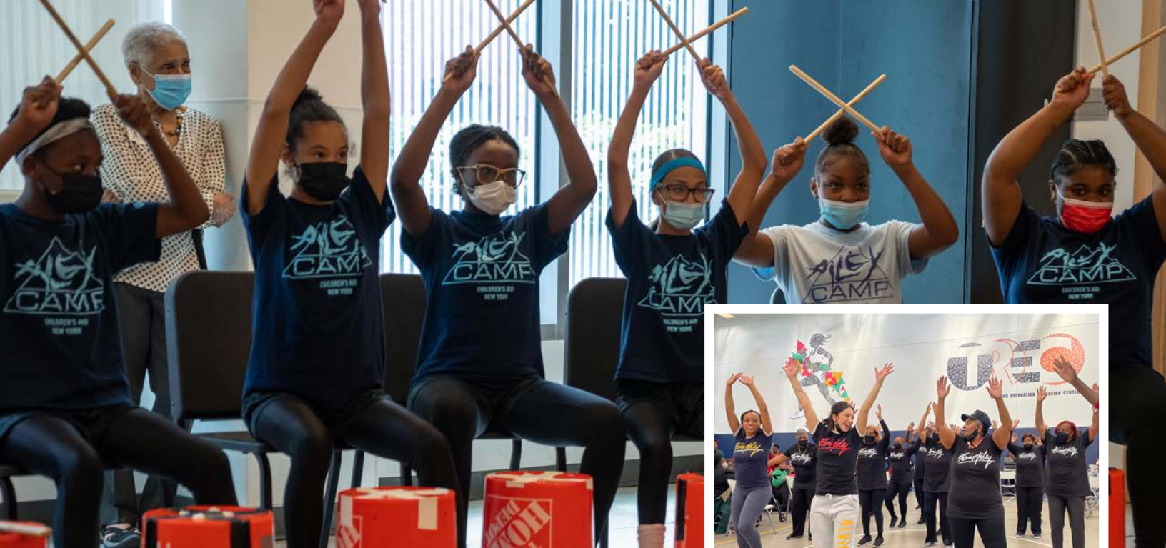
Top: Children's Aid AileyCamp New York percussion class.