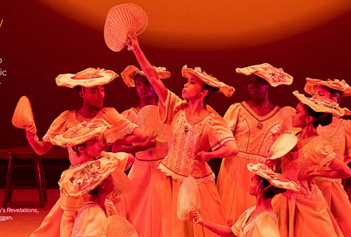
Alvin Ailey American Dance Theater in Alvin Ailey's Revelations, 2023 Ailey Spirit Gala.

The Ailey company returned to the Brooklyn Academy of Music for the first time since 2010 for its one-week Spring Season with over 11,000 audience members. Prior to the start of the season, the Ailey Spirit Gala was hosted at Jazz at Lincoln Center on May 24 and sponsored by Diageo.