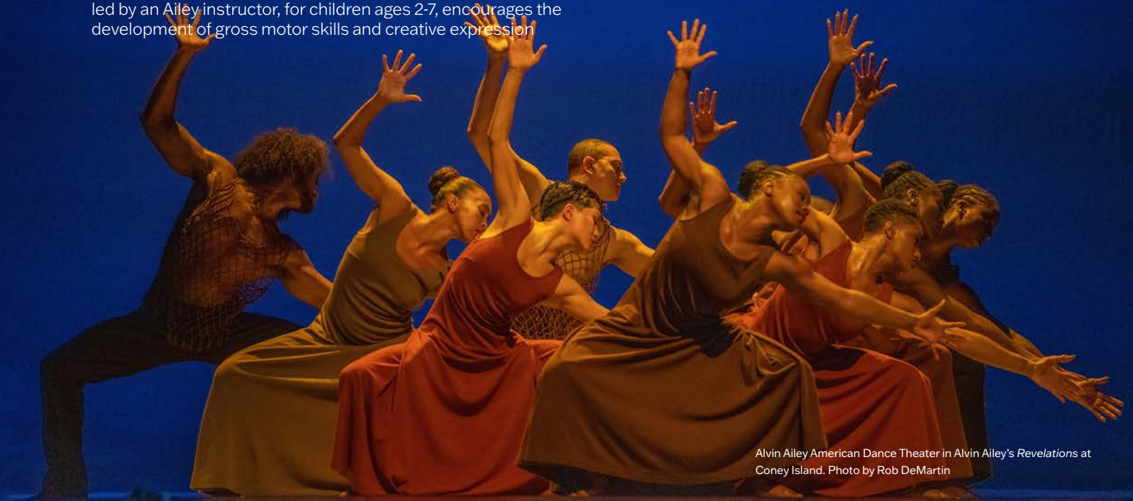
Alvin Ailey American Dance Theater in Alvin Ailey's Revelations at Coney Island.