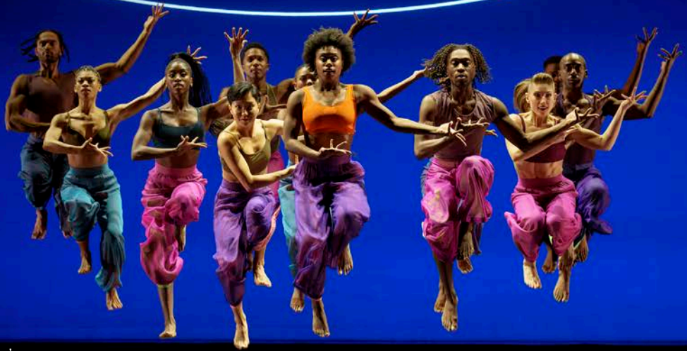
Members of Alvin Ailey American Dance Theater in Kyle Abraham's Are You in Your Feelings?.

The season also featured new productions of Alvin Ailey's Survivors (1986) and Ronald K. Brown's Dancing Spirit (2009), along with the Company premiere of Twyla Tharp's Roy's Joys (1997).